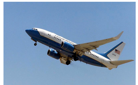
Boeing 737 BBJ Business Jet . The largest jet that currently uses Farnborough Airport.

the existing infrastructure" and benefit the national and local economy. It seems, however, that little thought has been given to the bigger picture and the